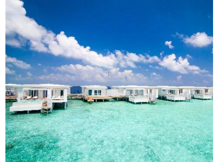
Lagoon Water Pool Villa 1 bedroom | 9 Villas | 220sqm 2 bedrooms | 2 Villas | 350sqm