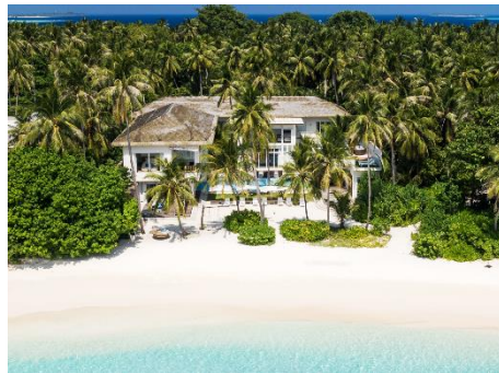
The Amilla Estate 6 bedrooms | 1 Residence | 2,550sqm