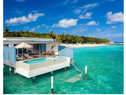
Sunset Water Pool Villa 1 bedroom | 10 Villas | 220sqm