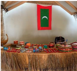
WE ARE MALDIVIAN