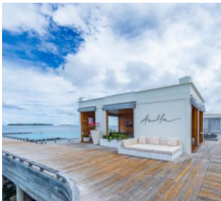
FREE PCR TESTS ON ARRIVAL