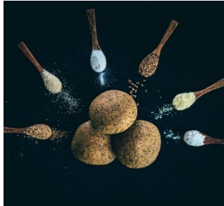
WELLNESS YOUR WAY