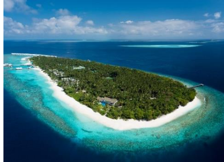
Amilla Island 1.5 km long x 800m wide | 67 Rooms