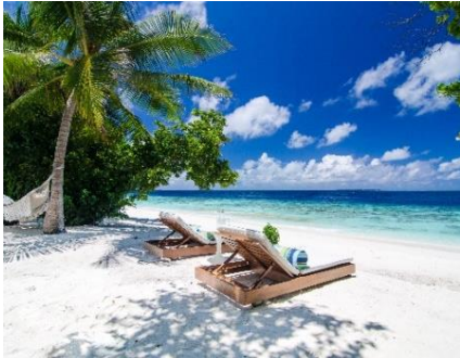
Beach Pool Villa 1 bedroom | 6 Villas | 470sqm 2 bedrooms | 4 Villas | 530sqm