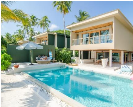
Beach Residence 4 bedrooms | 6 Residences | 920sqm