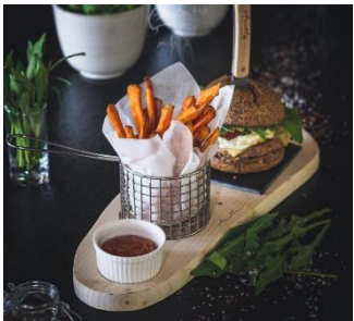
HOMEMADE and HOMEGROWN @AMILLA