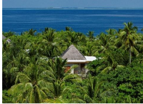
Treetop Pool Villa 1 or 2 bedrooms | 5 Villas | 250sqm