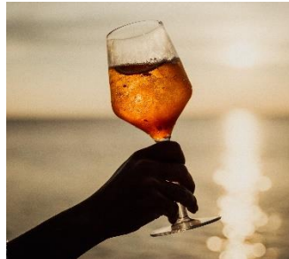
DINE AROUND INCLUSIVE