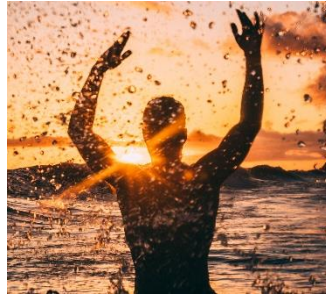
AN ISLAND OF SURPRISES