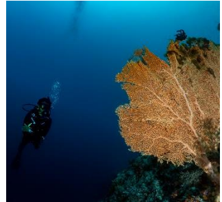
VOTE FOR THE PLANET