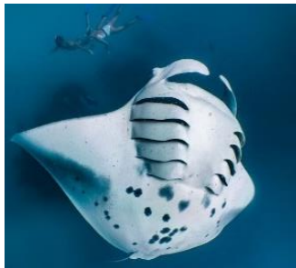
IT'S BETTER IN BAA