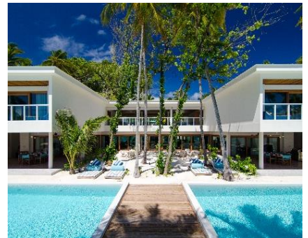
Great Beach Residence 8 bedrooms | 1 Residence | 2,400sqm