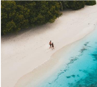
SPACE TO PLAY