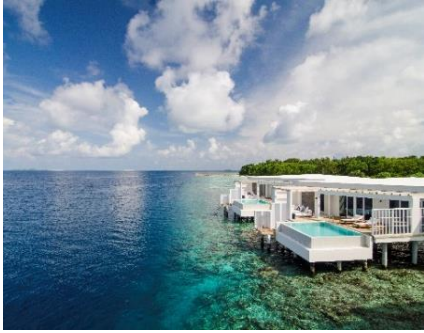
Reef Water Pool Villa 1 bedroom | 23 Villas | 220sqm